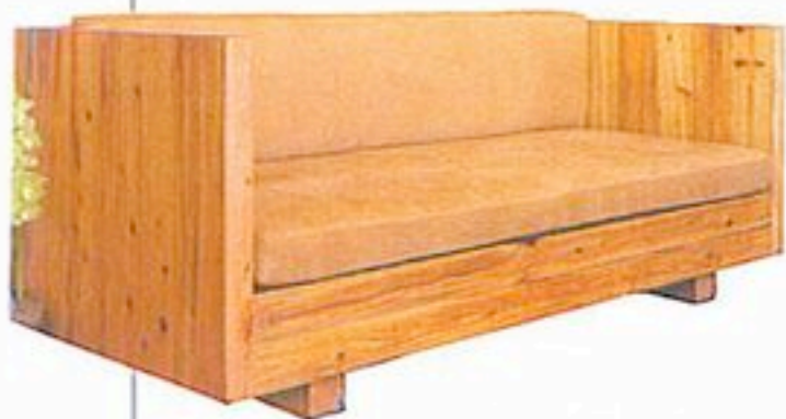
Above, the sinker-cypress Llano sofa; right, the Viking swing

Texas designer Marla Henderson's furniture is fashioned by master craftsmen and boatbuilders. Humble materials such as sinker cypress, a wood reclaimed from the bottom of a river, are used with atypical techniques such as steaming, usually used in boatbuilding, to create unusual pieces.