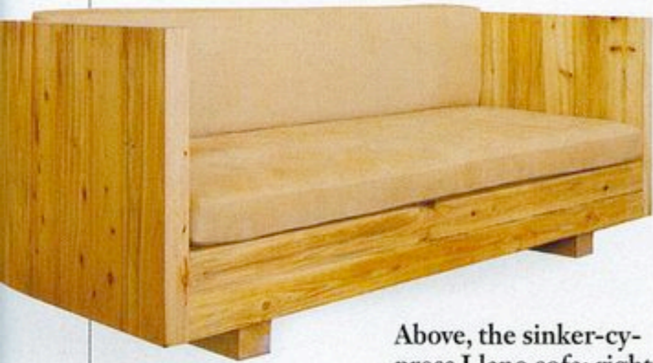
Above, the sinker-cypress Llano sofa; right, the Viking swing

Texas designer Marla Henderson's furniture is fashioned by master craftsmen and boatbuilders. Humble materials such as sinker cypress, a wood reclaimed from the bottom of rivers, are used with historical techniques such as steaming, traditionally used in boatbuilding, to create unusual pieces.